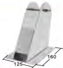
MAST HOLDER stamped AISI 304 ITEM NO. Weight/g 003908 1820