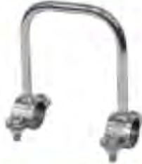
POLE HOLDER AISI 304 for \Phi 25\text{mm} tube ITEM NO. Weight/g 007999 160