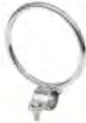
SPINNAKER POLE HOLDER AISI 304 for \Phi 25\text{mm} tube Ring \Phi 90\text{mm} ITEM NO. Weight/g 007994